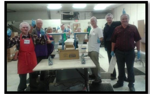
"Thumbs up" for 1 Million servings packaged.

Great News Everyone!!! On Friday, June 12, we reached a remarkable milestone - 1 MILLION soup servings packaged. Thank you to our amazing volunteers, produce donors and funding donors. Without your support, none of this would be possible. Together we are reducing hunger and waste.