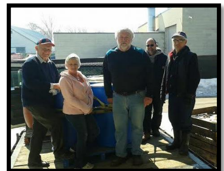
SWO Gleaners' team loading shipment for Guinea, West Africa.