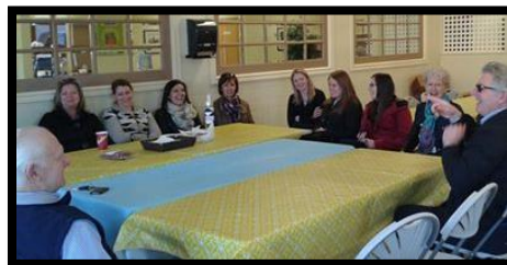
We had a nice visit from the folks at the Ontario Student Nutrition Program (above) Thanks for all that you do to ensure our local youth don't go hungry! We were happy to help!