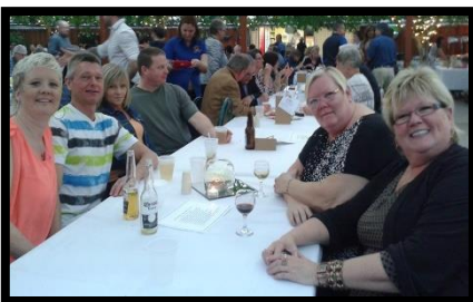
Fundraiser guests smiling for the camera...