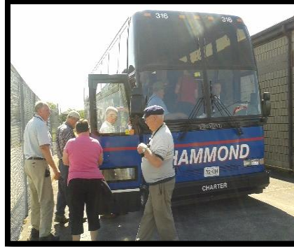
The North Simcoe Crop & Soil Improvement Association touring our operation.