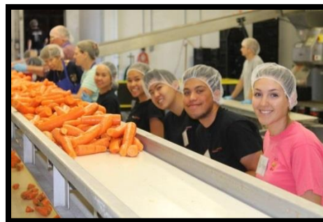
Pictured above: Volunteers from St. Clair College, Thames Campus; Tecumseh United Church and 401 Truck Source