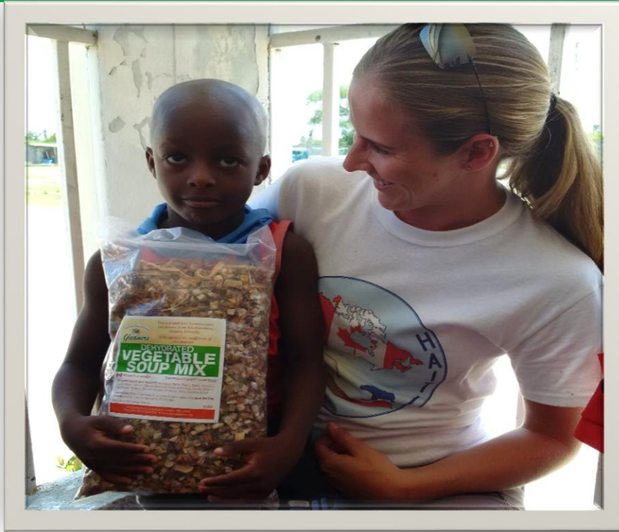
SOUTHWESTERN ONTARIO GLEANERS' SOUP ARRIVING IN HAITI